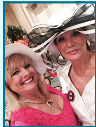
Photo Booth Sponsor $ 2,000 Hat Parade Sponsor $ 2,000 Silent Auction Sponsor $ 2,000

Diamond Presenting Sponsor $10,000 Platinum Sponsor $ 7,500 Gold Sponsor $ 5,000 Silver Sponsor $ 2,500 Bronze $ 1,000